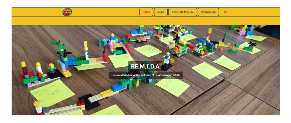
Renewed Models for the Inclusion of Disadvantaged Adults

The Facebook page of this project is <a href="https://www.facebook.com/RemidaProject/">https://www.facebook.com/RemidaProject/</a>